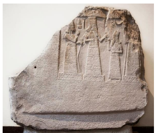
Fig 3. Stele showing Shamash-resh-uşur praying to the gods Adad and Ishtar with an inscription about beekeeping in Babylonian cuneiform

It is known that Sumerians living in Mesopotamia accepted the honey as a medicine in 3000 BC. The first humans naturally took advantage of their honey by killing bees nesting in tree hollows and rock cavities (Bakan, 2009).