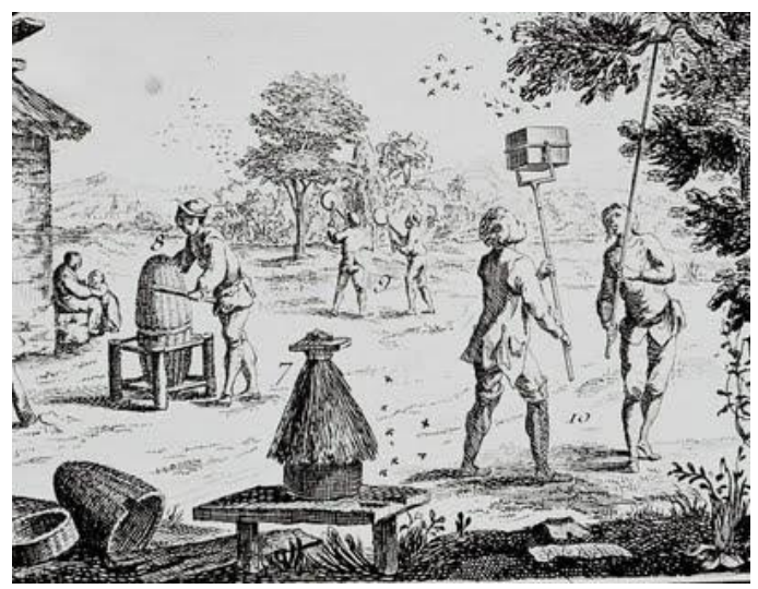
Fig 9. Beekeeping in 1772 as illustrated in "L'Encyclopédie ou Dictionaire Raisonné Des Sciences et Arts et des Métiers"

The real beekeeping activity started when people took a part of the honey and left the honey they needed without destroying the bee colonies in the tree holes. In time, when the amount of honey produced by bees in natural tree hollows started to be insufficient, artificial bee nests were created from carved tree stumps. In the historical process, people began to make various types of bee hives by taking advantage of the opportunities that the geography they live in. Large pots were used as beehives in the warm and forestless regions of the Middle East. (Kafkasdanısmanlık, 2020).