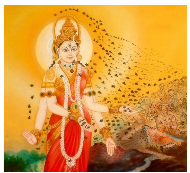
Fig 8. Brahmi, the Bee Goddess

The real beekeeping activity started when people took a part of the honey and left the honey they needed without destroying the bee colonies in the tree holes. In time, when the amount of honey produced by bees in natural tree hollows started to be insufficient, artificial bee nests were created from carved tree stumps. In the historical process, people began to make various types of bee hives by taking advantage of the opportunities that the geography they live in. Large pots were used as beehives in the warm and forestless regions of the Middle East. (Kafkasdanısmanlık, 2020).