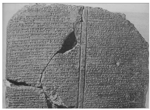
Fig 4. Laws relating bee keeping in Hittites

From the stone age in the historical development; First, mushrooms and tree stumps, and then containers made of earth and clay were used as hives, and the hives used today were developed over time. The real beekeeping started with people taking some honey and killing some honey to the bees without killing the bees nested in tree burrows. Since the gene centers of bees are Middle-Eastern countries, the emergence of beekeeping occurred in these countries. However, BC. The mention of bees in the stone inscriptions in Boğazköy, which is believed to belong to the 1300s and remained from the Hittites period, shows that beekeeping dates back to very old times in Anatolia (Anonymous, 2007).