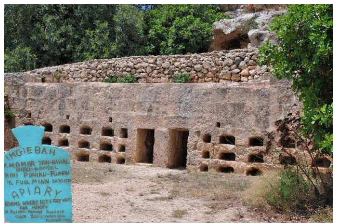
Fig 6. Apiary in Malta

and pollen are found. In a law issued for bees in Rome in the years of 100 BC, it was stated that the bees that escaped were unattended, and whoever seized the bee son or placed it in a hive would be his property (Balc1, 1988).