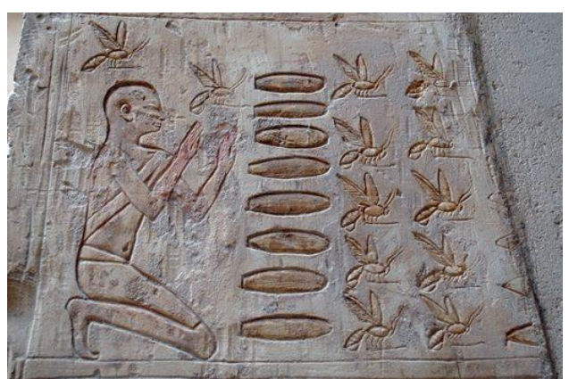
Fig. 2. Beekeeping in ancient Egyptians

These depictions show that beekeeping has a history of approximately 15,000 years. In recent years, 3.200 years of dried honey was found in the researches made in the pharaoh tombs in Egypt. The tablets read show that the ancient Egyptians have used honey for food, medicine and religious purposes since 4,000 years ago.